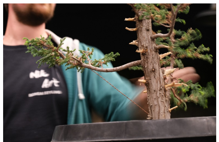
Using guide wires to reposition a branch down.