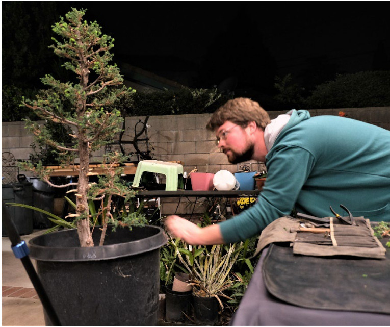
Checking the top and spacing. Finished tree on the right. The wire on the edge of the pot marks the front of the tree.