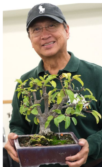
The styled tree! It will be raffled at our show in January.