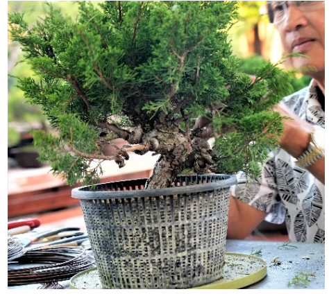
Note branches are wired down and the tip goes up. Branch is styled with curves and twists.