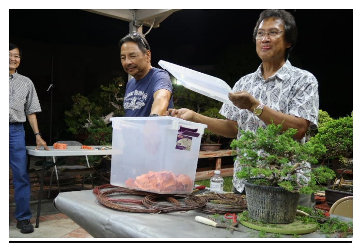
The beginning of the raffle when the ticket for the demo plant was chosen. And the winner???