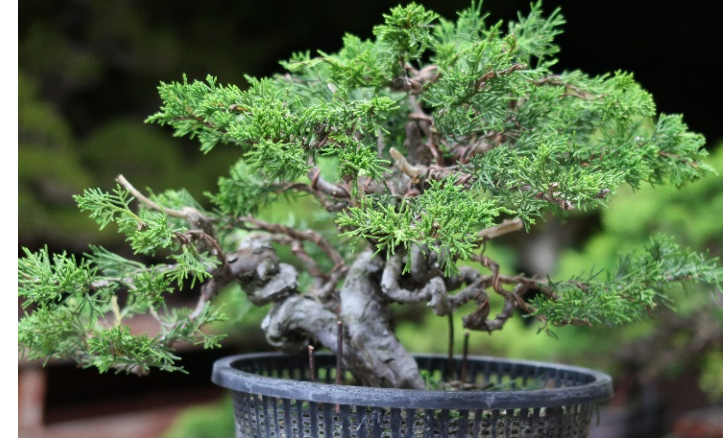
This tree has two fronts. Which one would you choose?