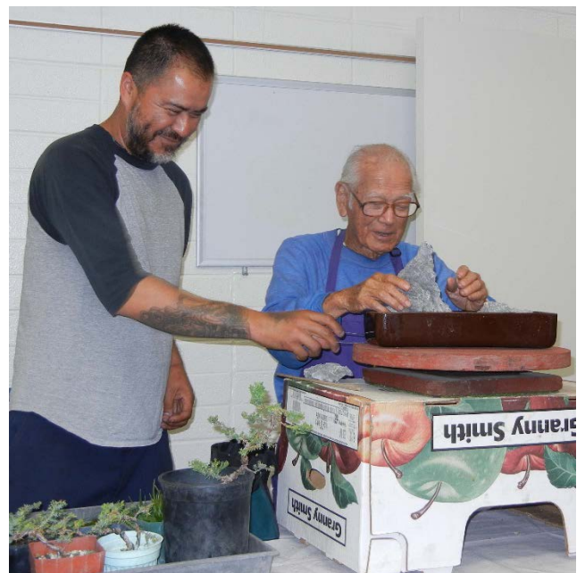
With special assistance from Jaime Chavarria

The scenery should show dimensions and depth. Therefore, the tree can be behind or in front the rock, but should not cover the rock. In saikei, the trees do not have to be perfect, just have some shape because the focus is on the landscape and not on the trees. Deciduous or