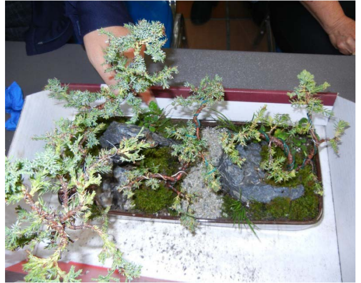
Carefully adding sand, to represent a stream (water) and (above right) top view of the finished saikei.