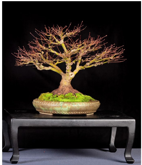
Japanese Maple Shishiohime