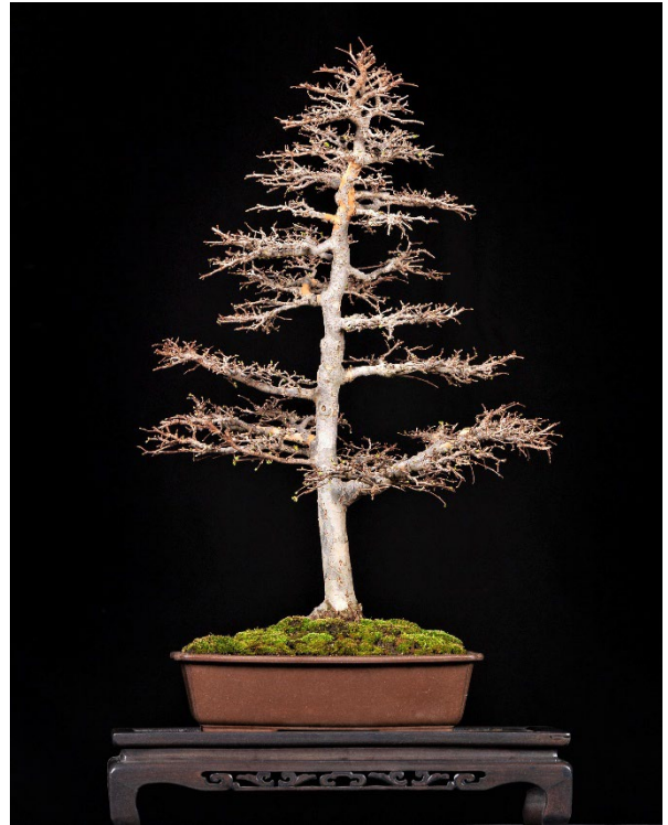
Chinese Elm – Robert King Marina Bonsai Club