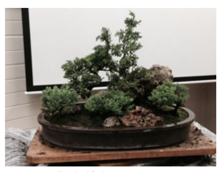
Finished Saikei. Beautiful, Ken!