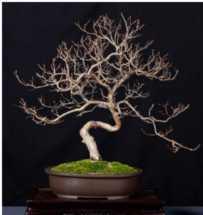
Crape Myrtle ~ Kay Ikan