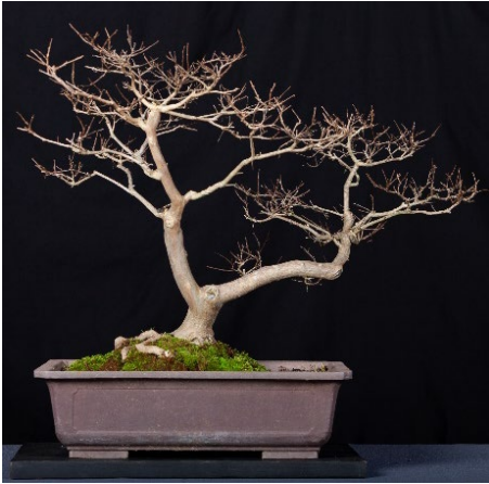
Crape Myrtle-Frank Goya