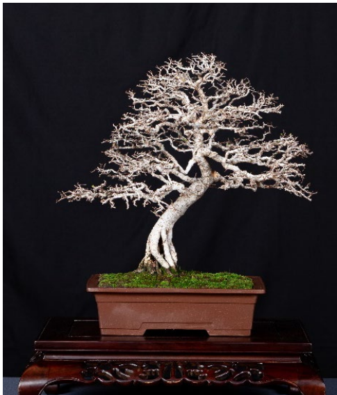
Chinese Elm ~ Ellen Keneshea