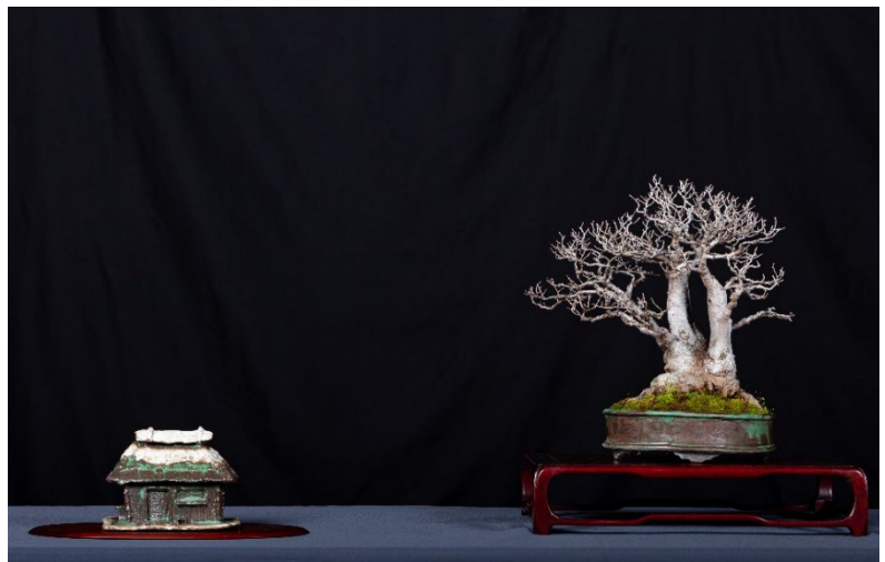
Shohin Display ~ Larry Ragle