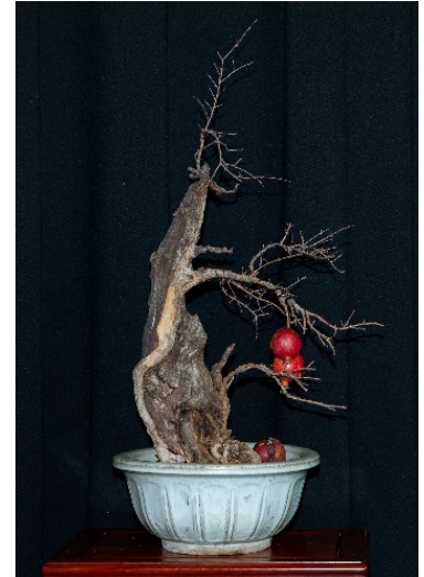
Pomegranate ~ Ken Teh