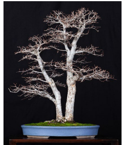
Snow Flake Elm-Ray Blasingame