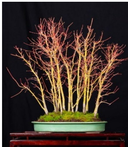
Coral Bark Maple