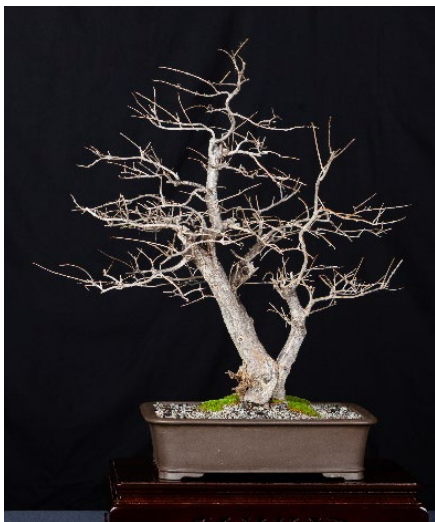
Pomegranate ~ Charlie Washburn