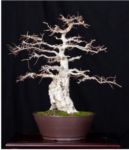
Korean Hornbeam