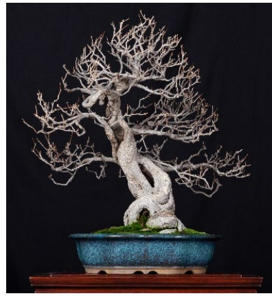
Pomegranate ~ Charlie Washburn