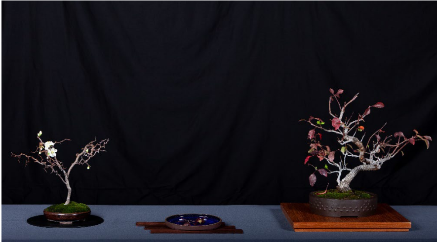
Contorted Quince & Flowering Pear ~ Al Nelson