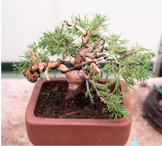
The finished tree!

Removing old soil in preparation for repotting (Fig 7). First the pot is prepared with a plastic or metal screen to hold back the soil, but to allow drainage of water. Note the anchoring wires at the four corners of the pot (Fig 8). Last twisting the anchoring wires together with the jin pliers to so that the plant does not move when adding soil and after watering (Fig. 9)